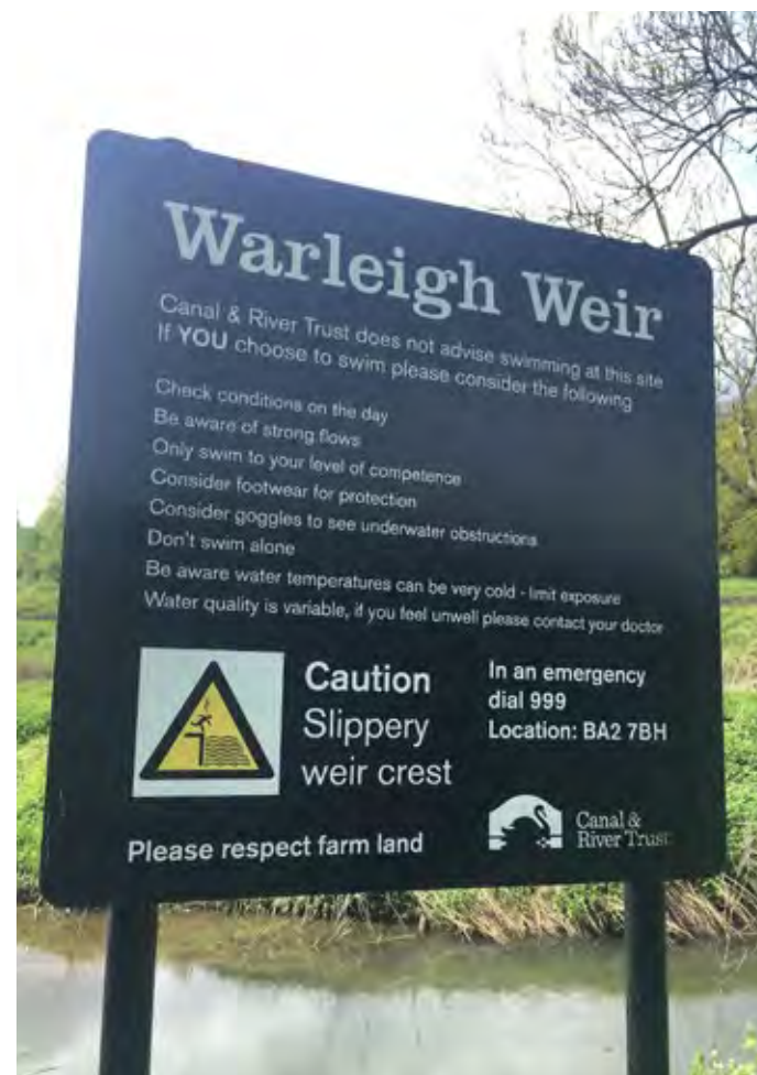
An example of good signage at an unsupervised site.

Find it at: wildswim.com/church-stretton-reservoir